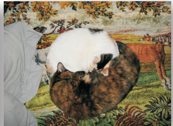
A peek into the life of Sugarbear and Star.

So from our home to yours we send our holiday greetings and best wishes for 2009!