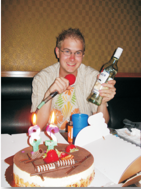
A mic, a bottle and a cake. Ah, it's good to be 28!