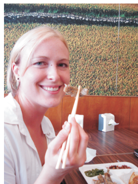
Yes - I really ate that!