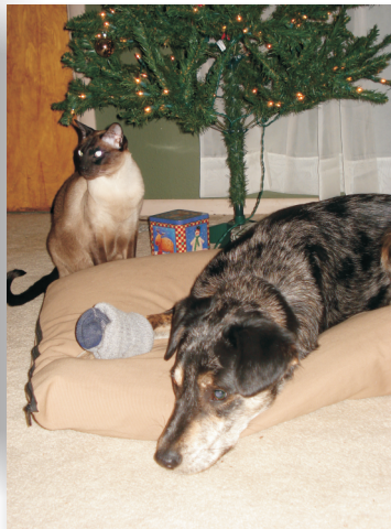
Mojo and Jupiter: Partners in sock-related crime!