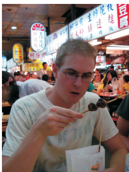
Don't ask what part of the chicken that is.